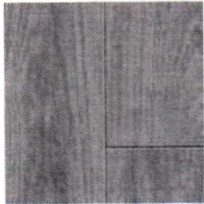
Laurel Oak 51942P Parquetry