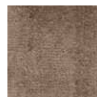
6671 silver brown