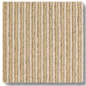
Ochre String Pin 1866