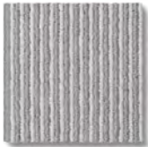
Moon Mineral Pin 1863