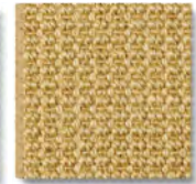
Buckler's Hard 1301