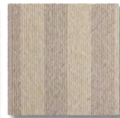
Canvas Olive Bloc 1855