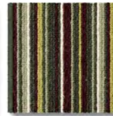
Wild Thing 1966