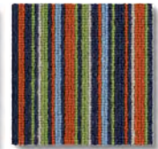
Tutti Frutti 1955