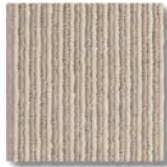
Canvas Olive Pin 1865