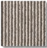
Sable Bone Pin 1862