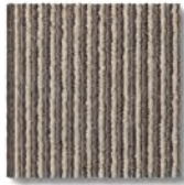
Sable Olive Pin 1860