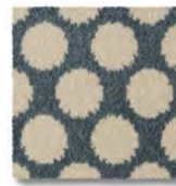
Duck Egg 7023