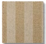
Ochre String Bloc 1856