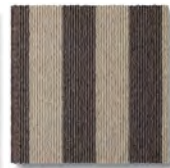
Sable Olive Bloc 1850