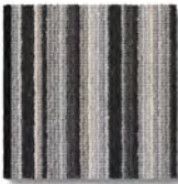
Back in Black 1980