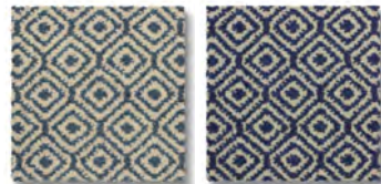
Duck Egg 7003