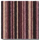
Purple Rain 1984