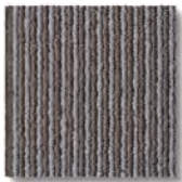
Mineral Sable Pin 1864