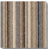
Tainted Love 1981