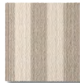
Bone Olive Bloc 1851