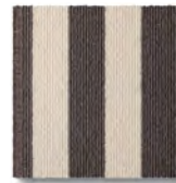
Sable Bone Bloc 1852