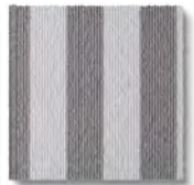
Moon Mineral Bloc 1853