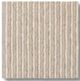
Bone Olive Pin 1861