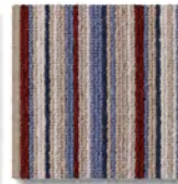
London Calling 1979