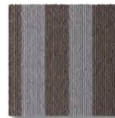
Mineral Sable Bloc 1854