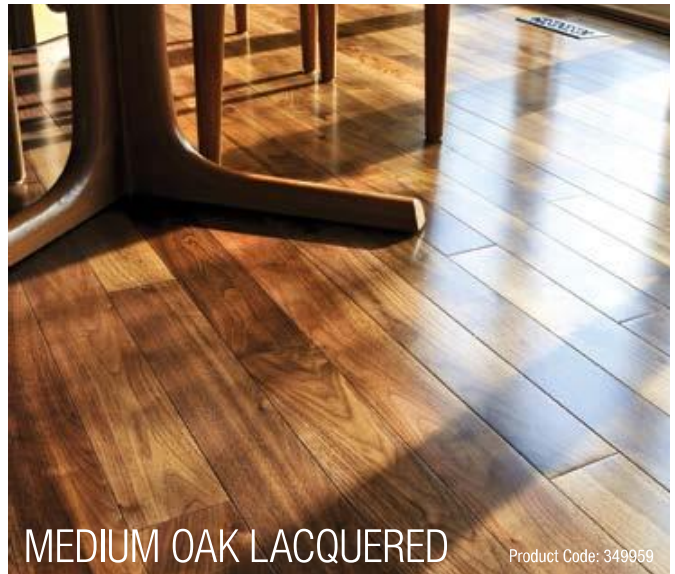
MEDIUM OAK LACQUERED