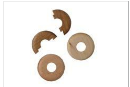
Real Wood Pipe Surrounds