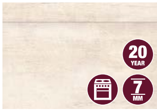
Bleached White Teak