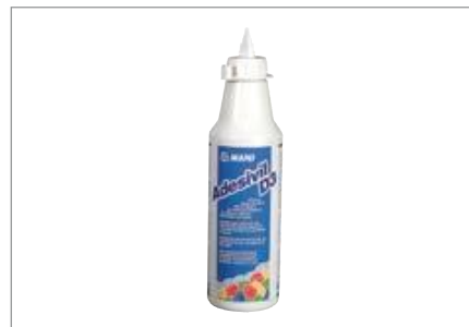
D3 Solvent Free Adhesive