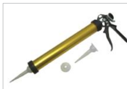
Flooring Adhesive Gun