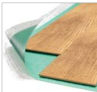
Combat Foam Underlay with Moisture Barrier