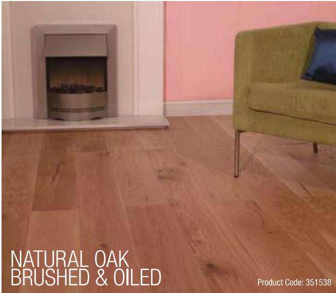
NATURAL OAK BRUSHED & OILED