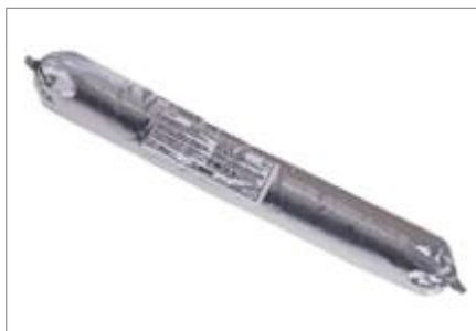
Ultrabond Flexible Adhesive