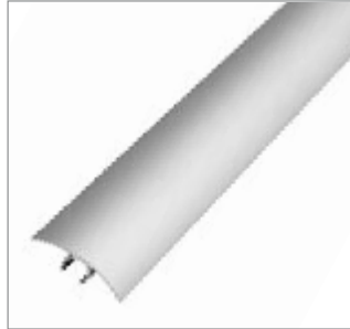
Multi Height T-Bar