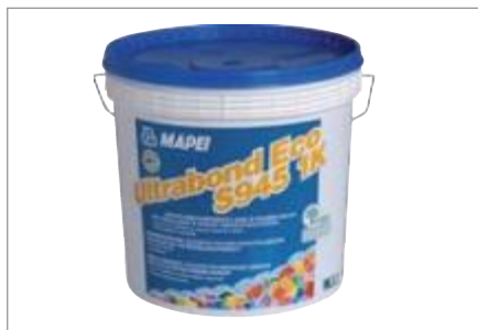
Polymer Flooring Adhesive