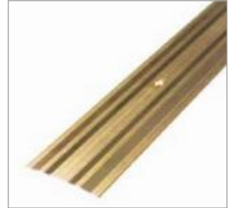
Cover Trim Extra Wide