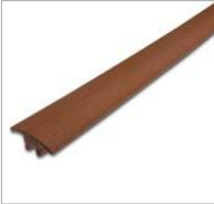
Multi Height T-Bar Timber Effect