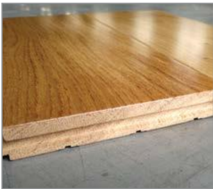
Solid wood flooring

Solid wood flooring is exactly what the name implies: a solid piece of wood from top to bottom. The thickness of solid wood flooring can vary, but generally ranges from 12-20mm. One of the many benefits of solid wood flooring is that it can be sanded and re-finished many times. Solid wood flooring can be installed on ground level and above ground level.