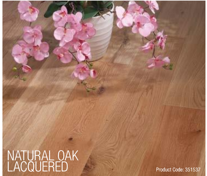
NATURAL OAK LACQUERED