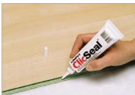
Clicseal Joint Seal