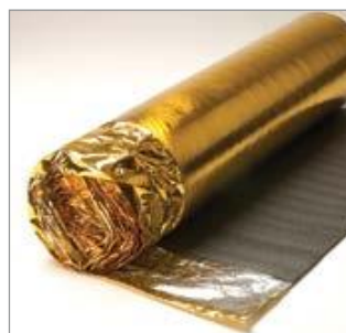
Sonic Gold Foil Underlay with Moisture & Acoustic Barrier