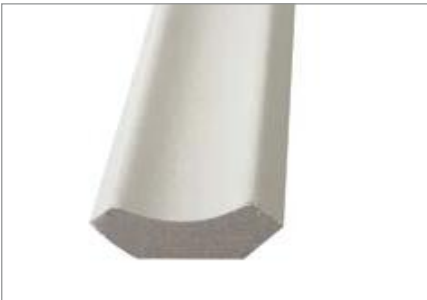
Scotia (2000 mm)