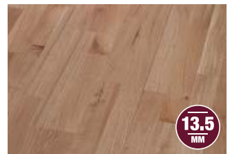
Natural Oak Lacquered