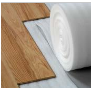
Comfort White Foam Underlay