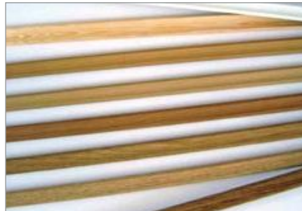
Laminate Colour Match Scotia (2600 mm)