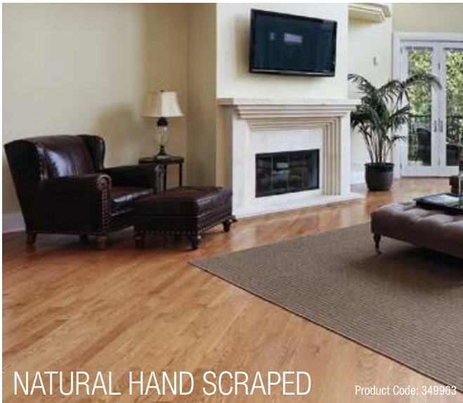
NATURAL HAND SCRAPED