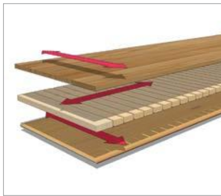
Engineered wood flooring

Real wood flooring that is manufactured using multiple layers of different wood veneers or fillets. The sub layers can be of the same species or, as in most cases, of different species. The grain of each layer runs in different directions, which makes it more stable than solid wood flooring. This means that the wood will expand and contract less than solid wood flooring during fluctuations in humidity and temperature. The top layer of engineered wood flooring consists of high quality wood species of different types, the most common being white oak. While this type of flooring can be sanded and finished, it cannot be done as many times as solid wood flooring. Engineered wood flooring can be installed below ground level and above ground level.