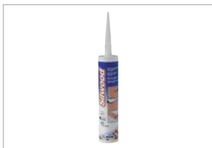
Sealant for Wood Floors