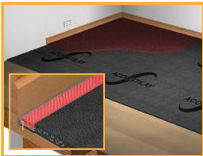
Acoustilay installed on a floor with perimeter strip and carpet gripper

Acoustilay Perimeter Strips are nailed or glued around the perimeter of the room with the barrier layer facing downwards and the acoustic seal, compressed by two thirds, to the wall or skirting board. Carpet gripper rods are then nailed in place on top of the Acoustilay Perimeter Strip. Acoustilay panels are tightly butted up to the perimeter detail, and loose laid in brick bond pattern onto the floor.