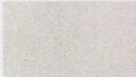
▲ 900 - Glacier Ice