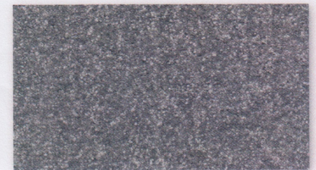
▲ 950 - Urban Chateau