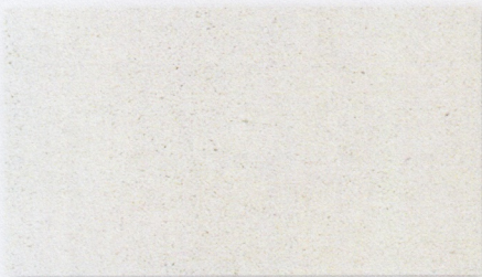
▲ 600 - Cloud Dream