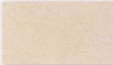
▲ 610 - Champagne Delight