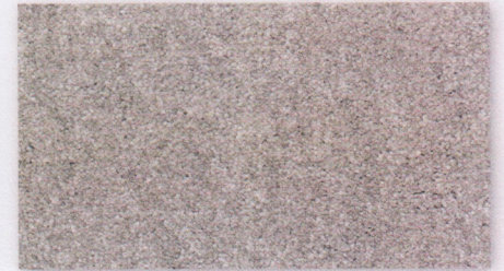
▲ 780 - Beach Cave