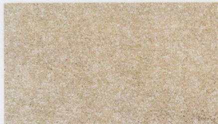
▲ 700 - Almond Latte