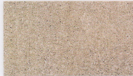
▲ 720 - Sand Drift