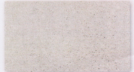
▲ 905 - Ground Mist