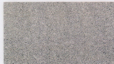
▲ 940 - Gray Glimpse