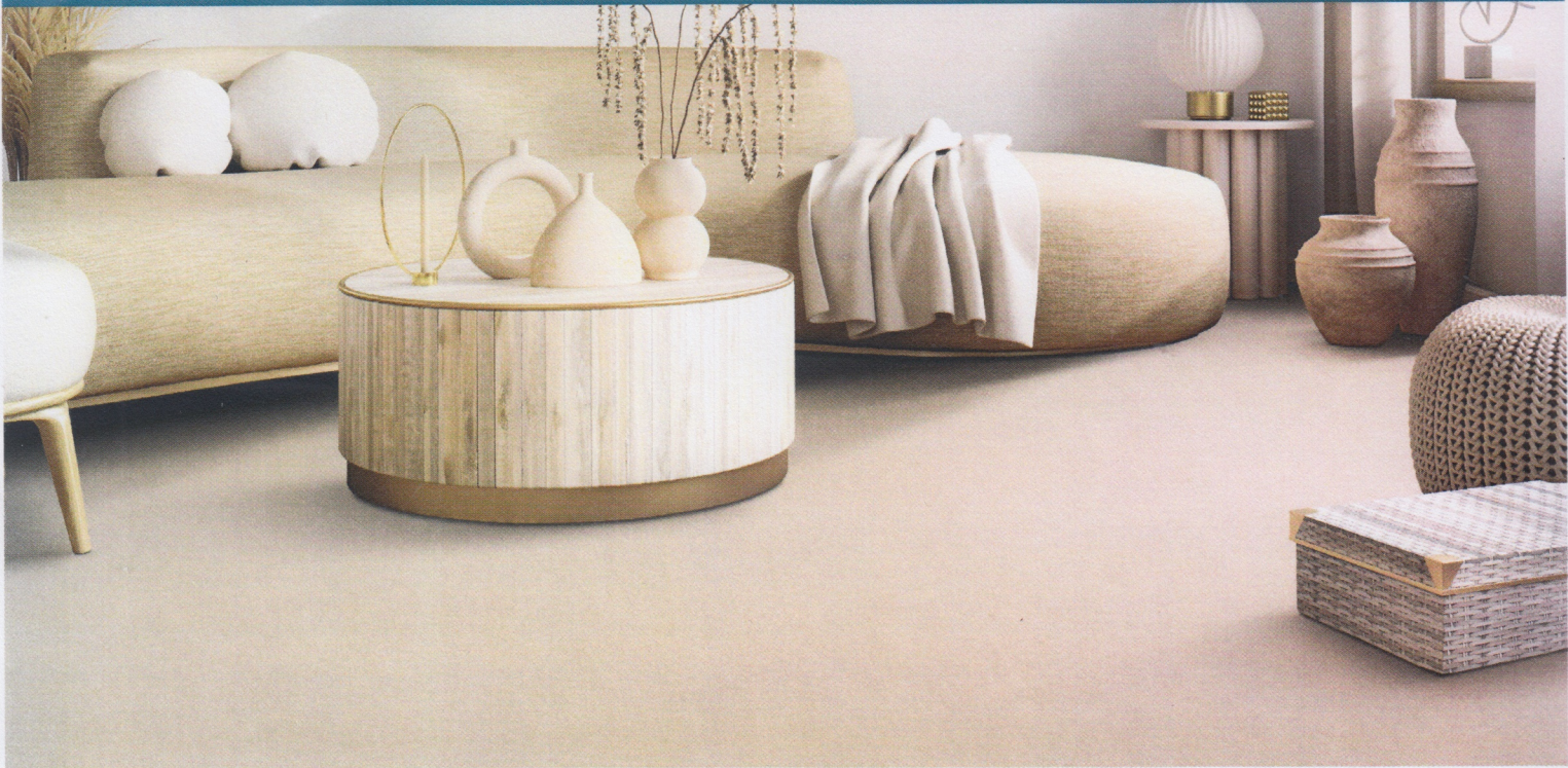
▲ 600 - Cloud Dream