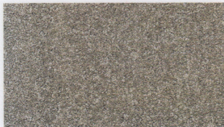
▲ 800 - Choco Shake