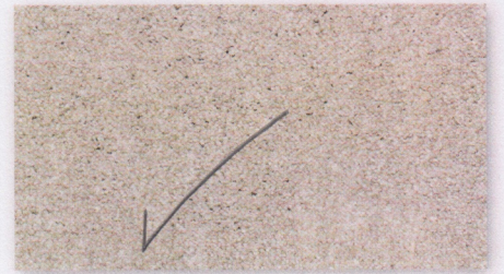
▲ 640 - Macadamia Nut