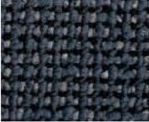
Milestone - 893 Blue