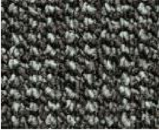
Tweed - 98 Slate