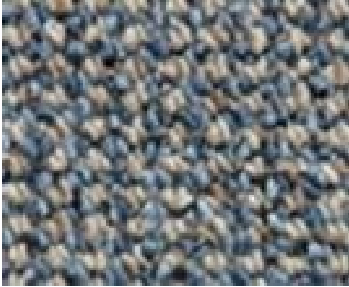
Tweed - 73 Blue Haze