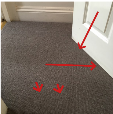
Excessive Pulling The front door is rubbing on the carpet at the entrance into the property so we would recommend to the customer that the door should be trimmed by the appropriate tradesman to help improve the pilling at this juncture, however the bedrooms are pilling badly too and there are no issues with doors rubbing in those areas.