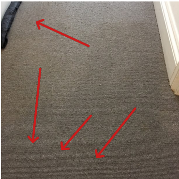
Hallway Excessive pilling