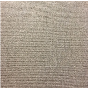
Bedroom Excessive pulling