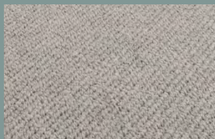
Rain Cloud 26