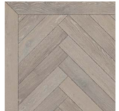
PF00932 - Aged