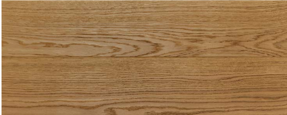
PF00911 - Satin