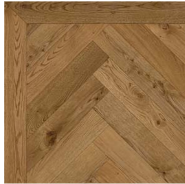
PFO0910 - Matt