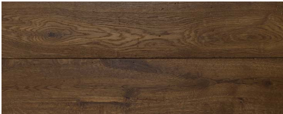
PF00943 - Aged