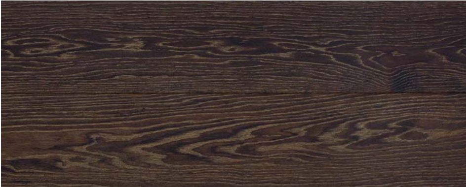
PFO1170 - Gold