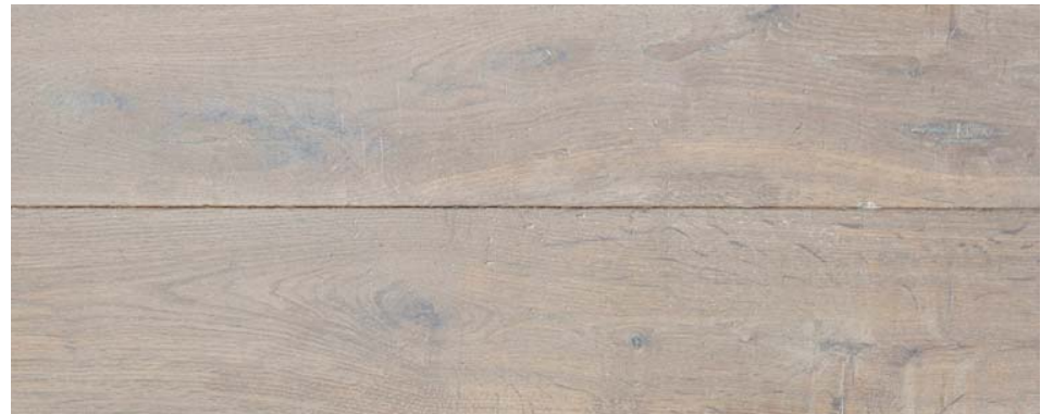
PF00925 - Aged