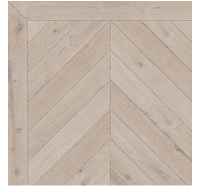
PF00919 - Aged