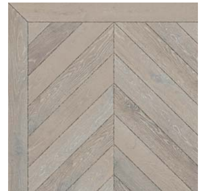
PF00932 - Aged