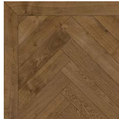
PF00924 - Aged