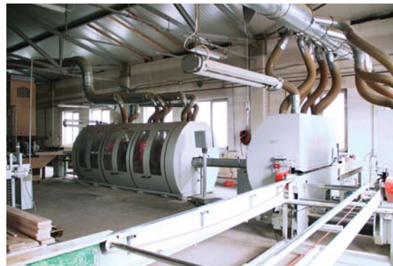
12. Profiling T&G