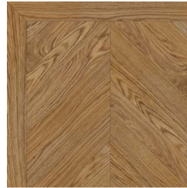
PFO0911 - Satin