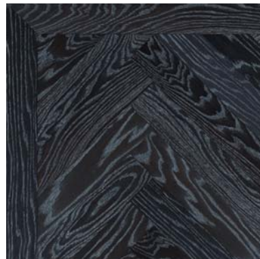
PFO1171 - Silver