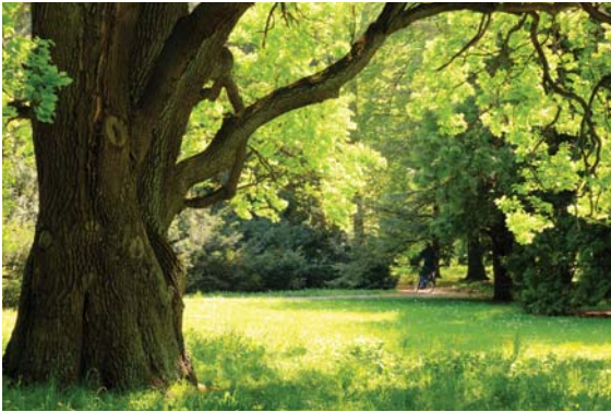
1. The Great Oak