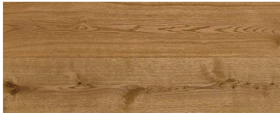
PF00910 - Matt