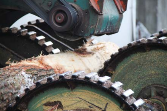
5. Bark removal