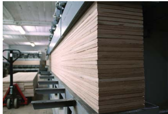
9. Cold press lamination