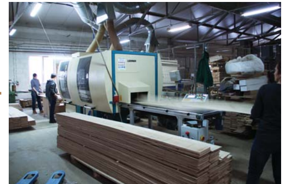
8. Lamella calibration