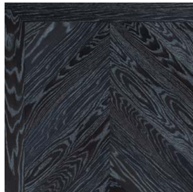
PFO1171 - Silver