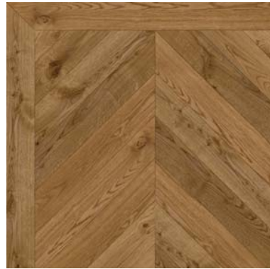
PFO0910 - Matt