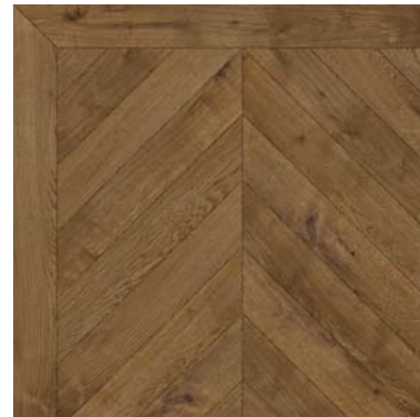
PF00924 - Aged