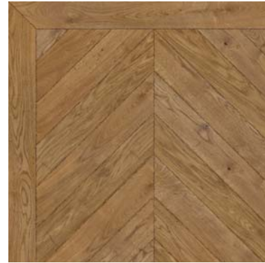
PF00912 - Aged