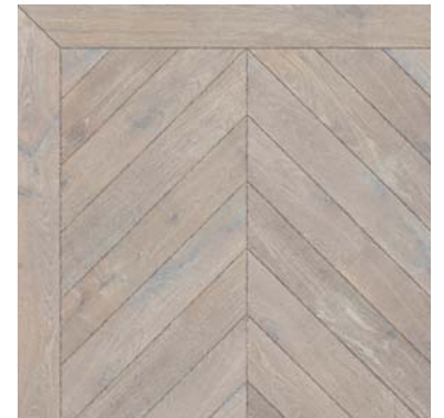
PF00925 - Aged