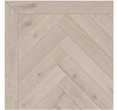
PF00919 - Aged