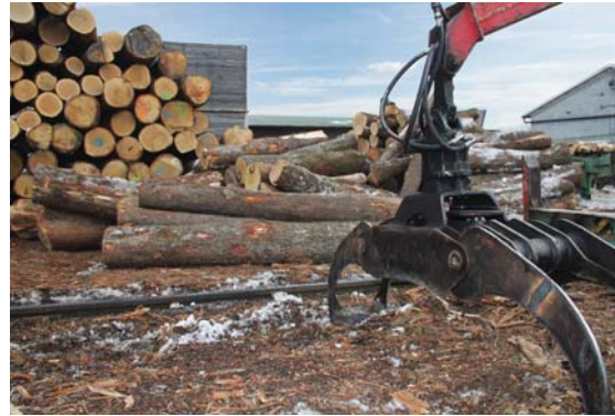
2. Logs arrive