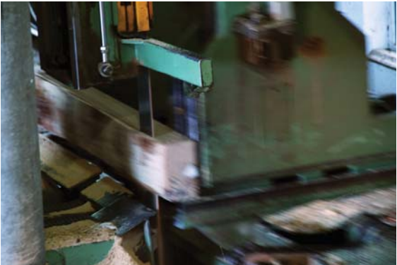
6. Lamellas cut