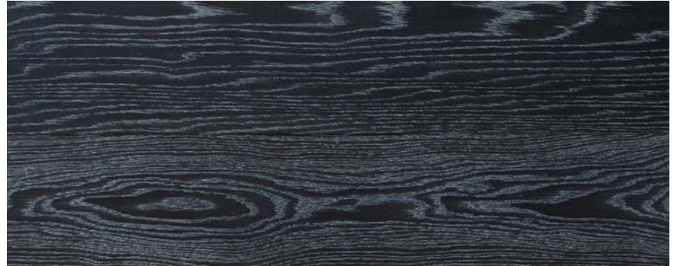
PFO1171 - Silver