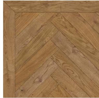
PF00912 - Aged