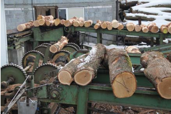
4. Logs processed