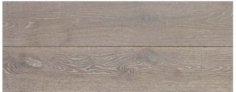
PF00932 - Aged