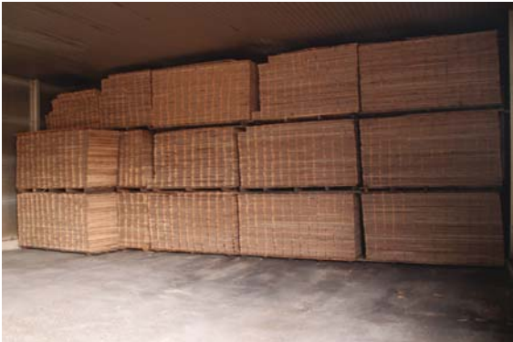
7. Kiln drying