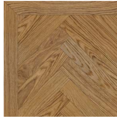
PFO0911 - Satin