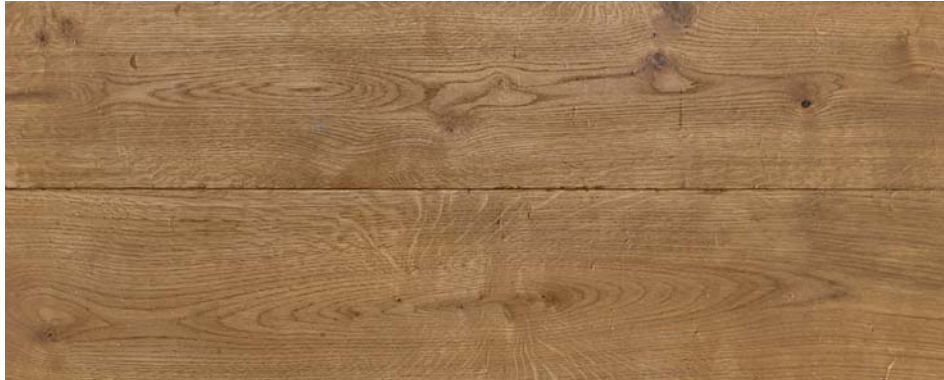
PF00912 - Aged