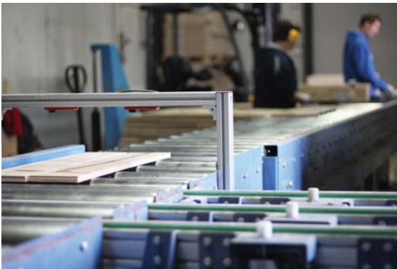
10. Automated filling