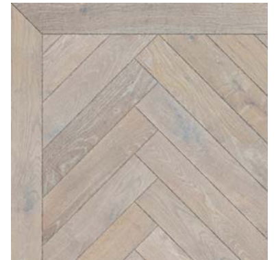
PF00925 - Aged