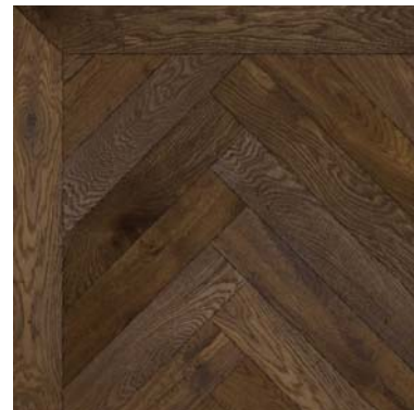
PF00943 - Aged