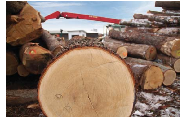
3. Logs selected