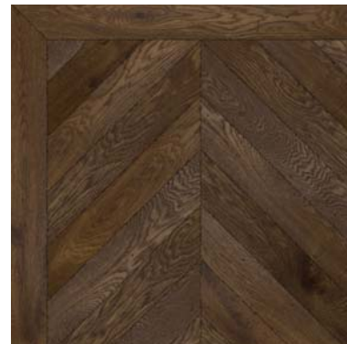
PF00943 - Aged