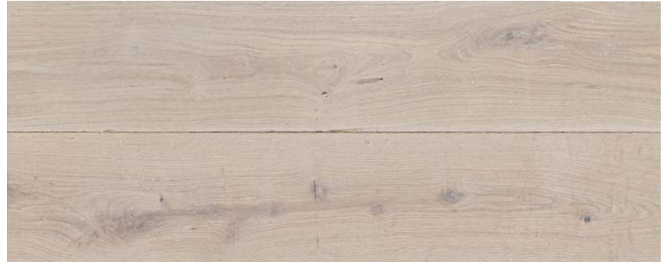
PF00919 - Aged