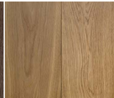
UV Oil Finish

UV cured hardwax oil. Available in Extra Matt, Matt, Satin & Gloss finishes.