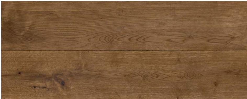
PF00924 - Aged