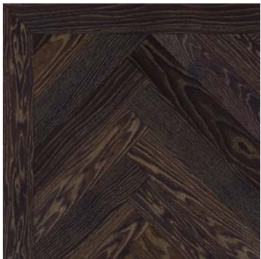
PFO1170 - Gold