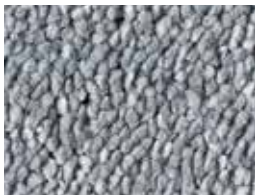
▲ SB: LSWE.0830 | 400 & 500 cm