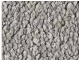
▲ SB: LSWE.0840 | 400 & 500 cm