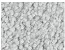
▲ SB: LSWE.0870 | 400 & 500 cm