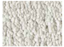
▲ SB: LSWE.0240 | 400 & 500 cm