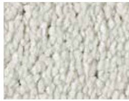
▲ SB: LSWE.0440 | 400 & 500 cm