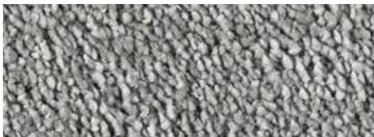
▲ SB: LSWE.0850 | 400 & 500 cm