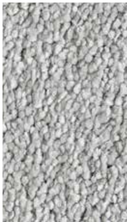
▲ SB: LSWE.0860 | 400 & 500 cm