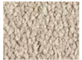
▲ SB: LSWE.0450 | 400 & 500 cm