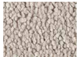
▲ SB: LSWE.0230 | 400 & 500 cm