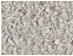
▲ SB: LSWE.0880 | 400 & 500 cm