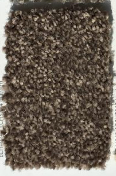
ECH4013 / ECH5013 Hagley