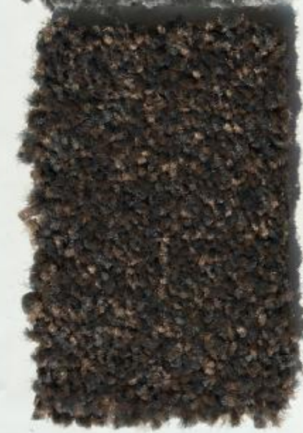
ECH4002 / ECH5004 Malvern