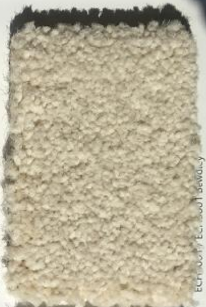
ECH4007 / ECH5007 Bewdley