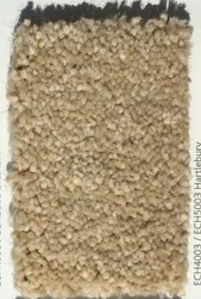
ECH4003 / ECH5003 Hartlebury