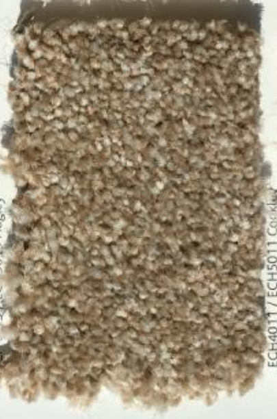
ECH4011 / ECH5011 Cosskley