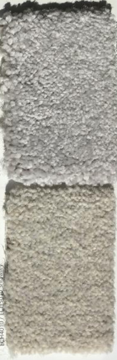
ECH4015 / ECH5015 Abberley