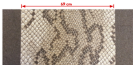
Name: RUNNERS NATURAL SNAKE Code: RUNNSNAKEI Design Number: 1-M588078F