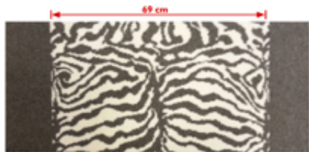
Name: RUNNERS NATURAL ZEBRA Code: RUNNZEBRAI Design Number: 2-M587678F