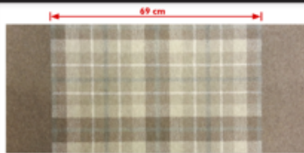
Name: RUNNERS NATURAL TARTAN PINE Code: RUNNTARPINI Design Number: 1-M598178F