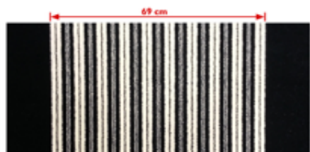
Name: RUNNERS STRIPES Code: RUNSSTRIPEI Design Number: 1-M597478F