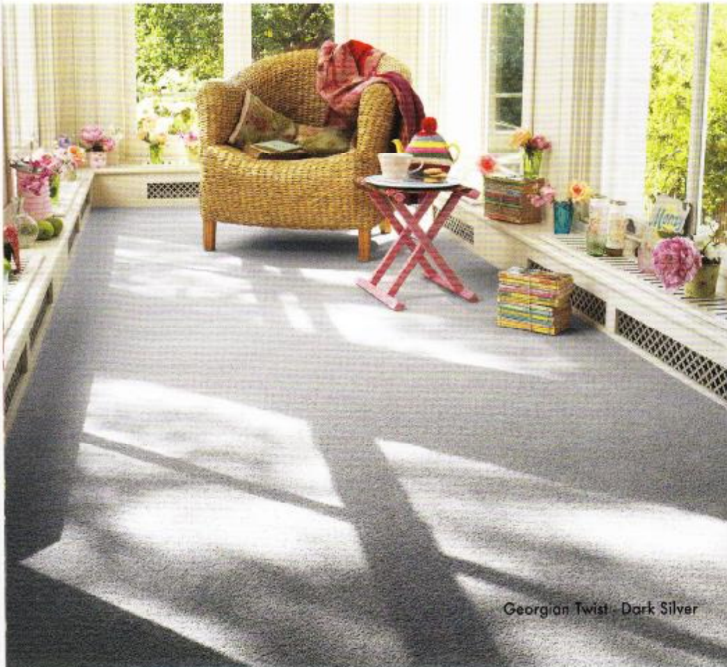
Georgian Twist - Dark Silver