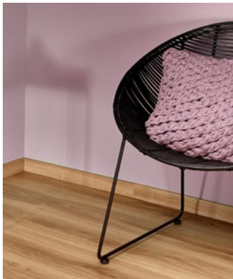
Matching and paintable skirting