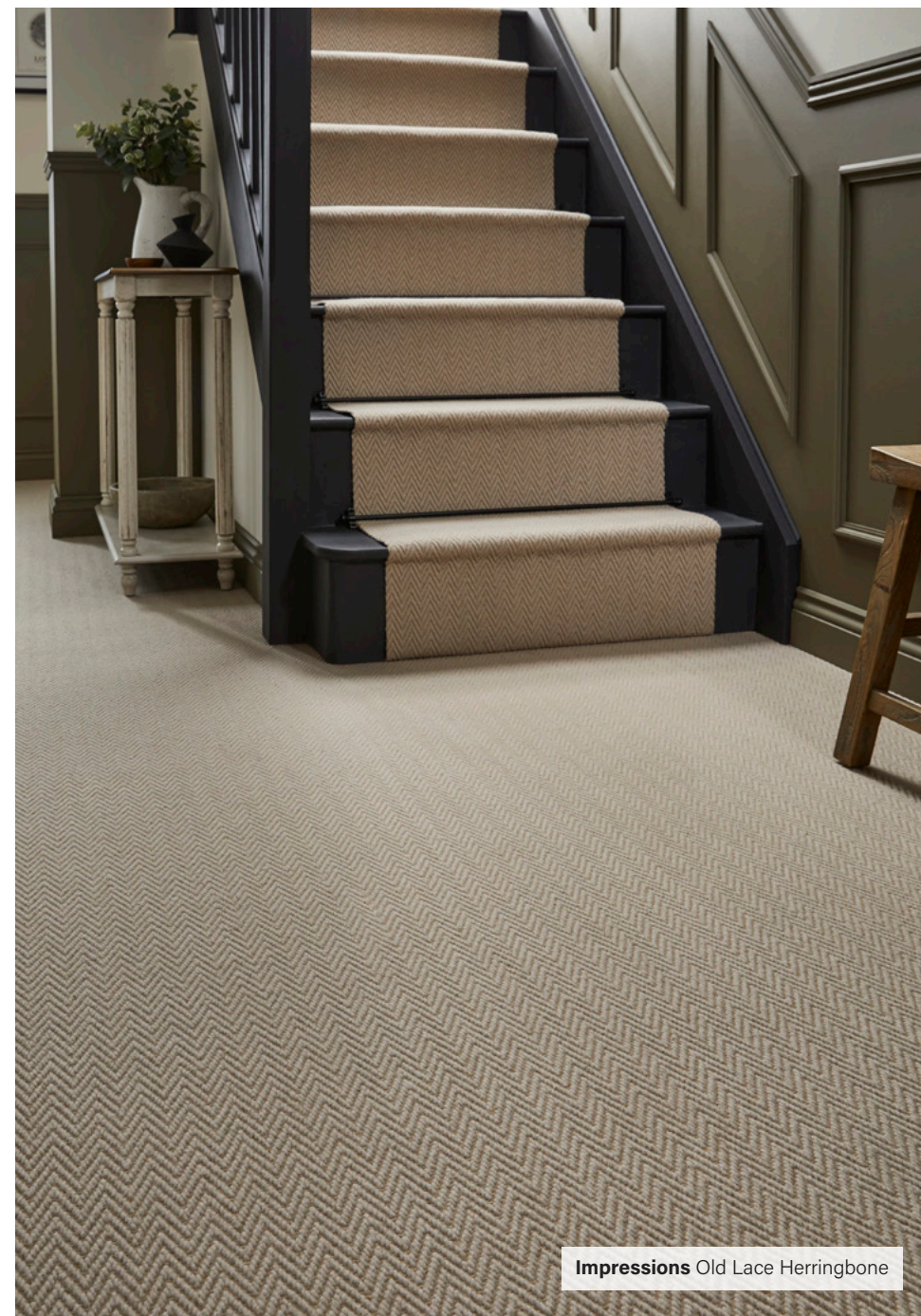
Impressions Old Lace Herringbone