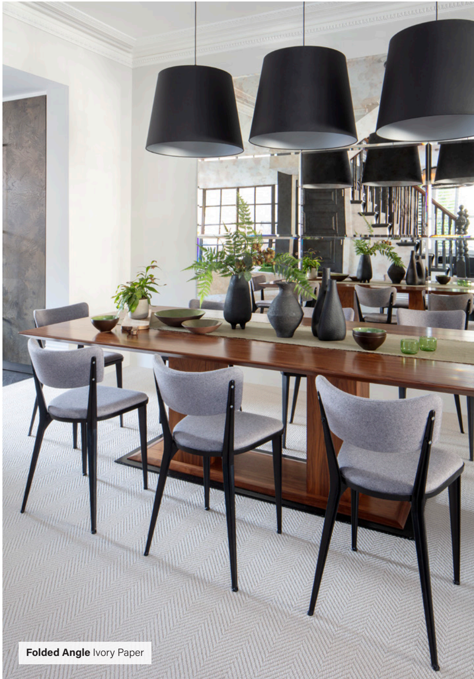
Folded Angle Ivory Paper