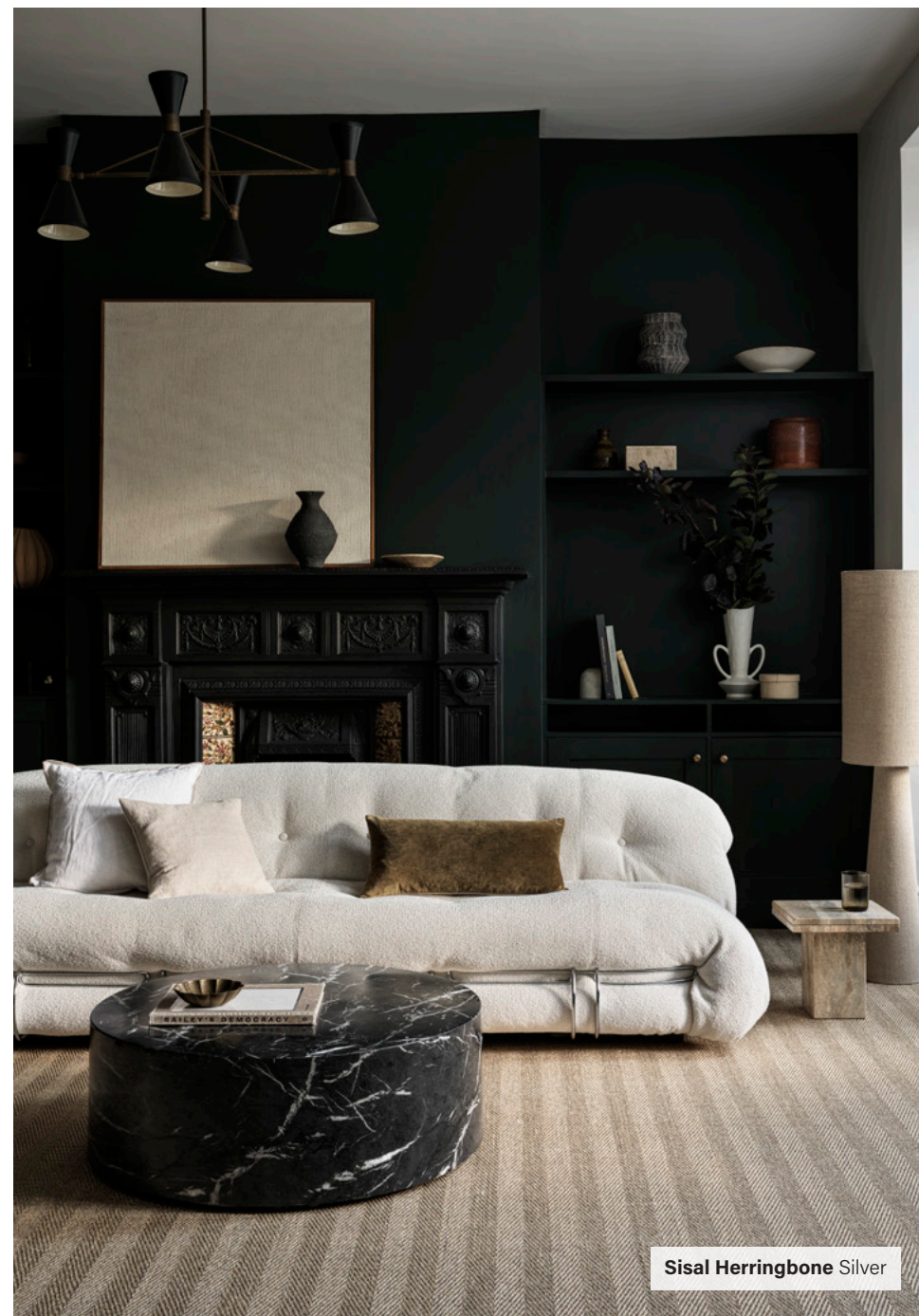
Sisal Herringbone Silver

For use on all Naturals and Wool flooring - £1.10m 2