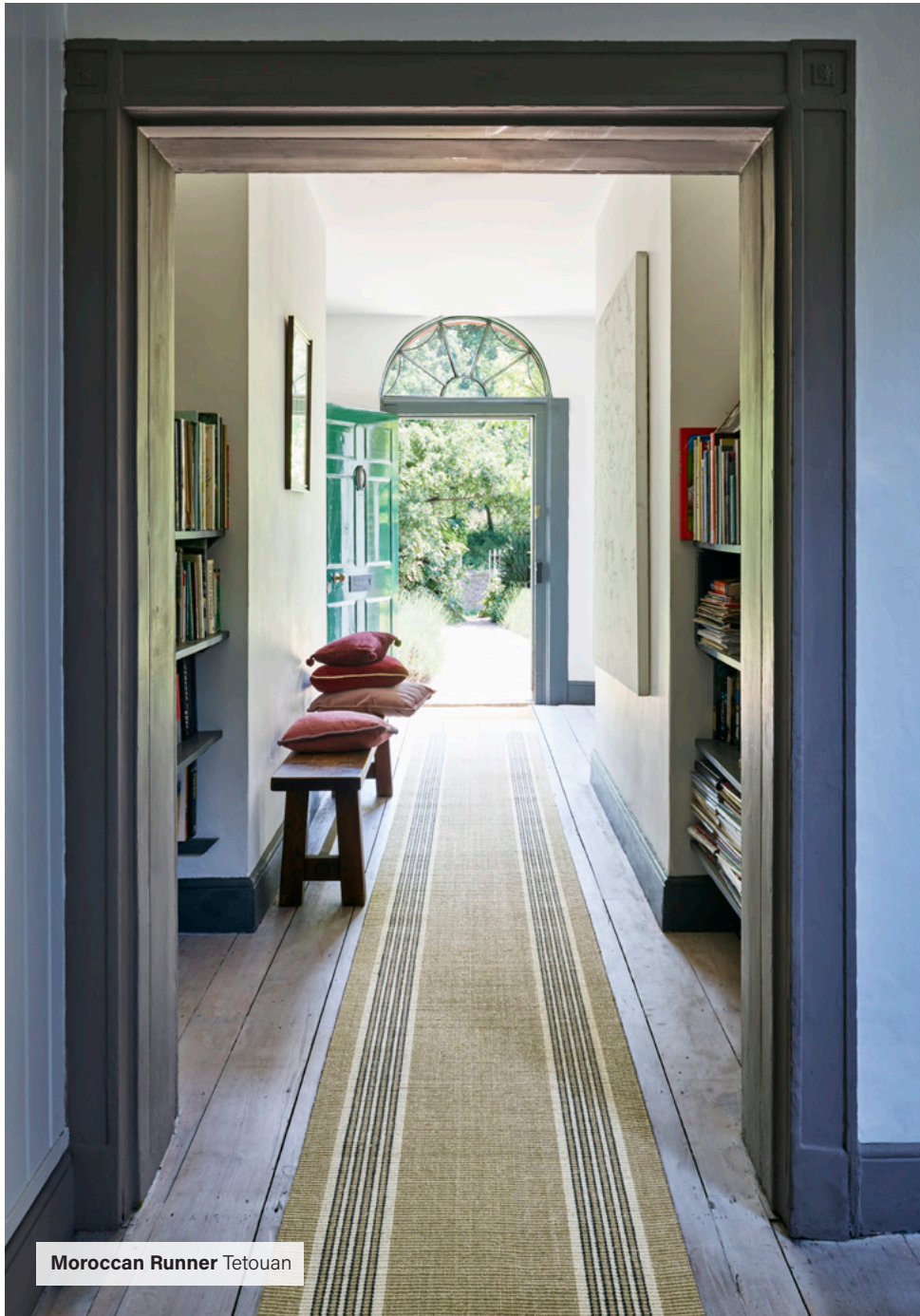
Moroccan Runner Tetouan