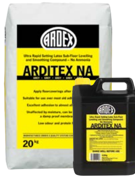
the original yellow bag®

REDUCES THE NEED FOR EXPENSIVE PREPARATION AND PRIMING | EXCELLENT ADHESION TO ALMOST ALL SUBSTRATES WITHOUT PRIMING: FLOORING GRADE PLYWOOD, BITUMEN ADHESIVE RESIDUES, GLAZED AND UNGLAZED CERAMIC TILES, QUARRY TILES, STEEL, FLOORING GRADE ASPHALT, ADHESIVE RESIDUES | UNAFFECTED BY MOISTURE | CAN BE USED UNDER AN ARDEX DAMP PROOF MEMBRANE, ARDEX MVS 95 MOISTURE VAPOUR SUPPRESSANT AND EVEN DIRECT TO DAMP CONCRETE | EXCELLENT FLOW, AS SMOOTH AS A WATER MIX | WALK ON IN 2 HOURS | APPLY RESILIENT FLOORCOVERINGS AFTER ONLY 4 HOURS AND CERAMIC TILES AFTER 3 HOURS | CAN BE APPLIED UP TO 30mm WITH THE INCLUSION OF ARDEX COARSE AGGREGATE | ULTRA RAPID SETTING EVEN AT THICKER APPLICATIONS | ADVANCED PERFORMANCE, EVEN AT LOWER TEMPERATURES | 5m 2 COVERAGE AT 3mm | SUITABLE FOR USE ON FLOORS WITH UNDERFLOOR HEATING | CAN BE USED TO ENCAPSULATE UNDER-TILE HEATING CABLES | MARINE APPROVED | LOW ODOUR AND PROTEIN FREE.