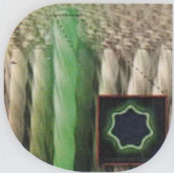
A classic carpet treated with protection layer

Therefore it is safe to say that every SmartStrand carpet is stain and soil resistant throughout its entire lifespan.